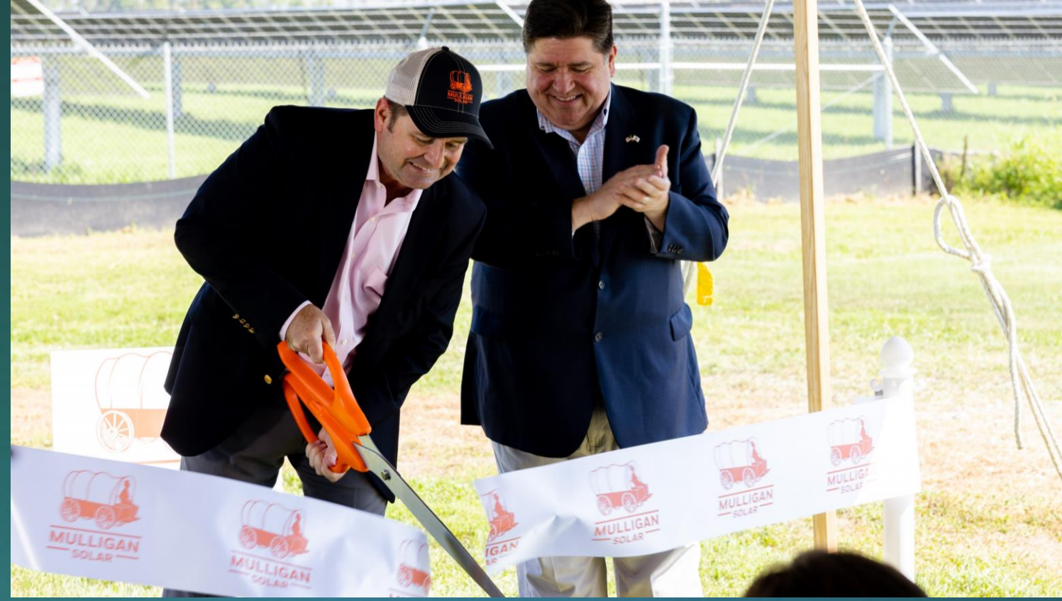
IL Governor JB Pritzker joins Apex at Mulligan Solar for a ribbon-cutting in 2022. The following January, Pritzker signs statewide permitting legislation into law. Due to the permitting certainty it created, it single-handedly allowed projects like Prosperity Wind to be built and has resulted in many new wind and solar projects in the state.