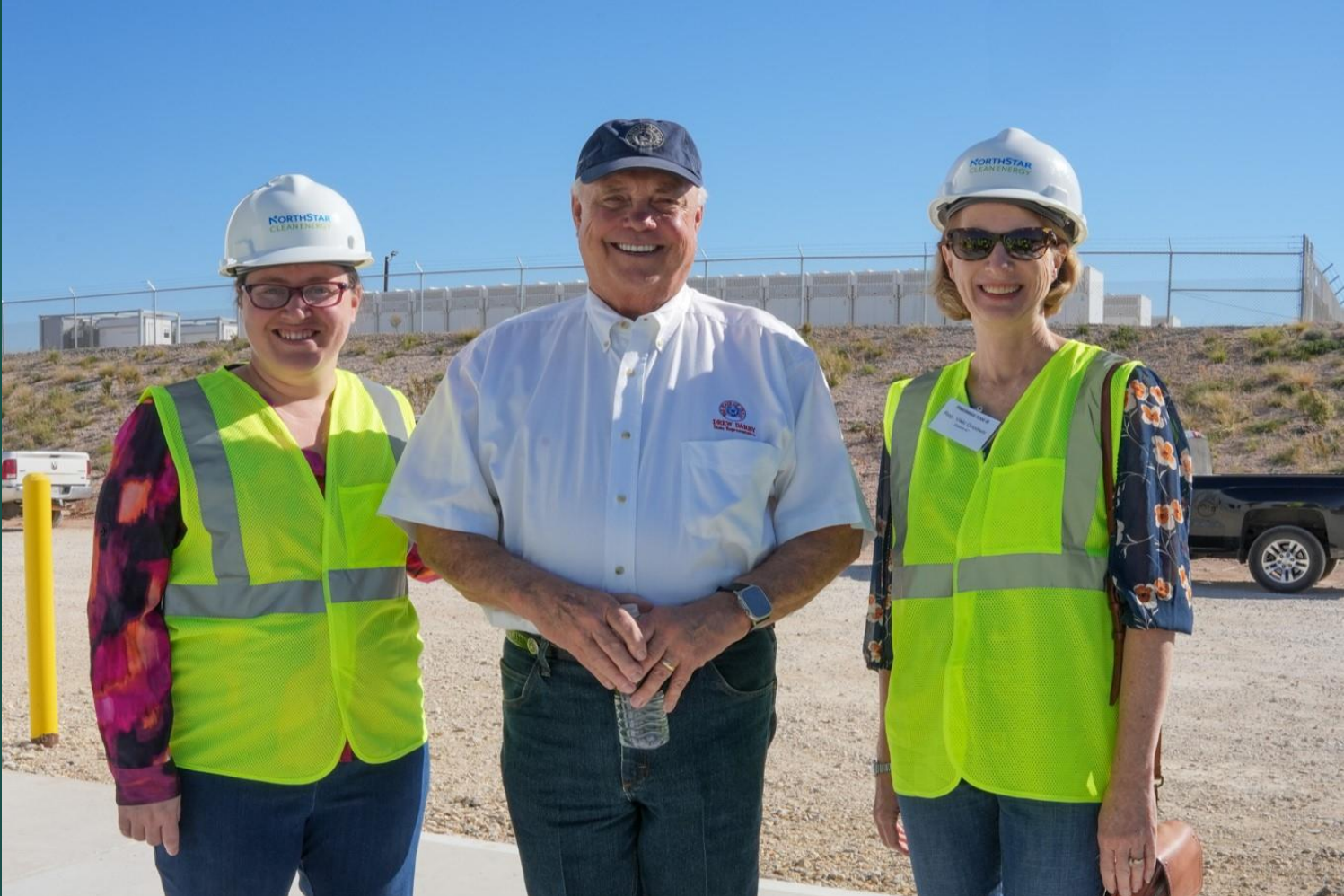
Representatives Drew Darby (TX-72) and Vikki Goodwin (TX-47) visit Aviator Wind and Angelo Solar. As Chairman of the House Committee on Energy Resources, Darby has led on transmission policy and blocked bills harmful to renewable energy.