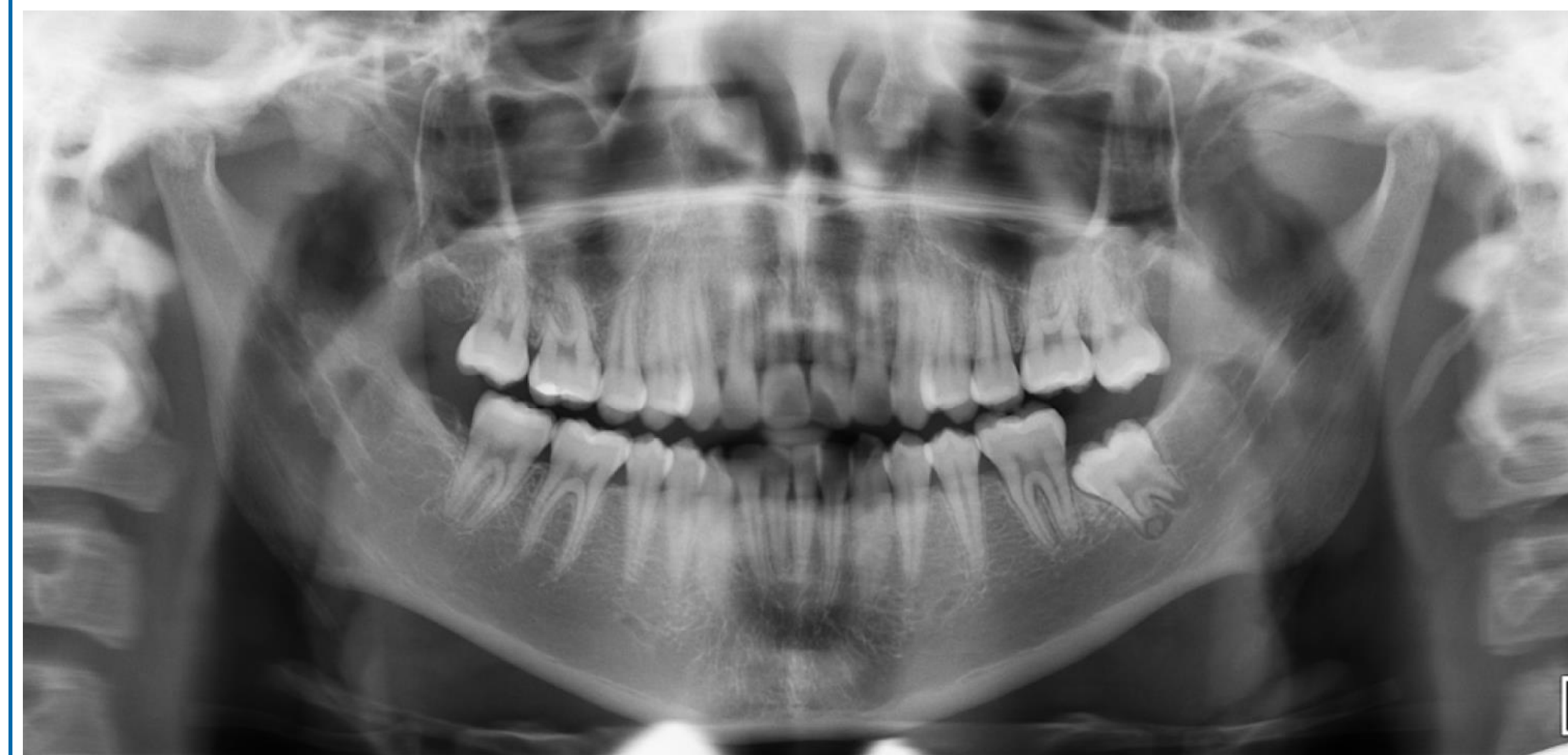
Figure 2: Panoramic radiograph demonstrating the affected tooth, in relation to the entire dentition