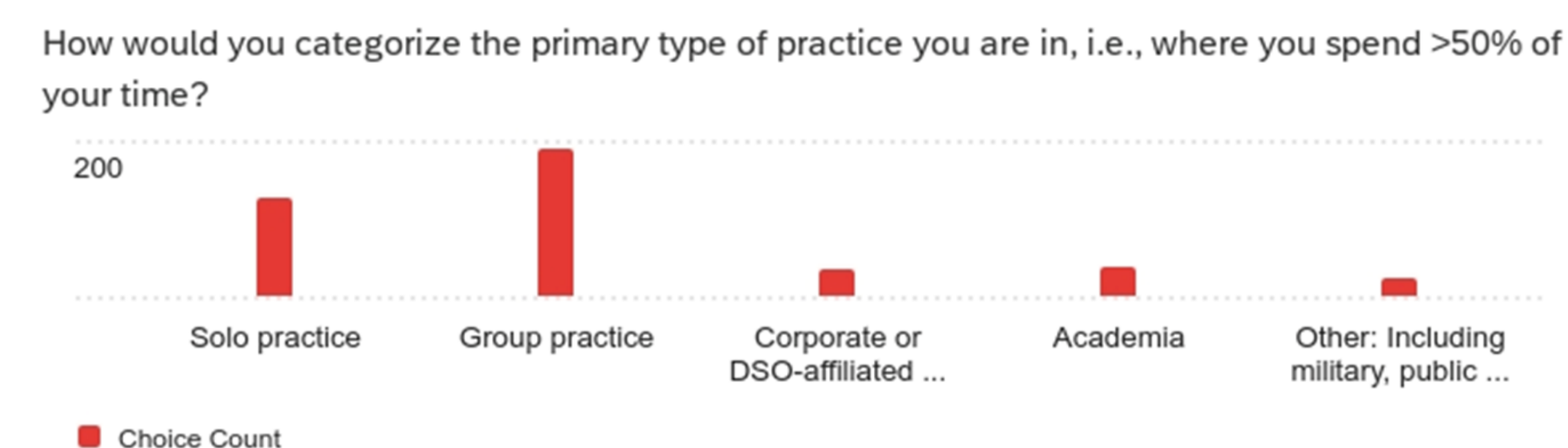
Figure 1: Data showing that most pediatric dentists work in a group practice

If you changed jobs, please indicate the reason(s) that you left the initial or subsequent position(s). Please select all that apply.