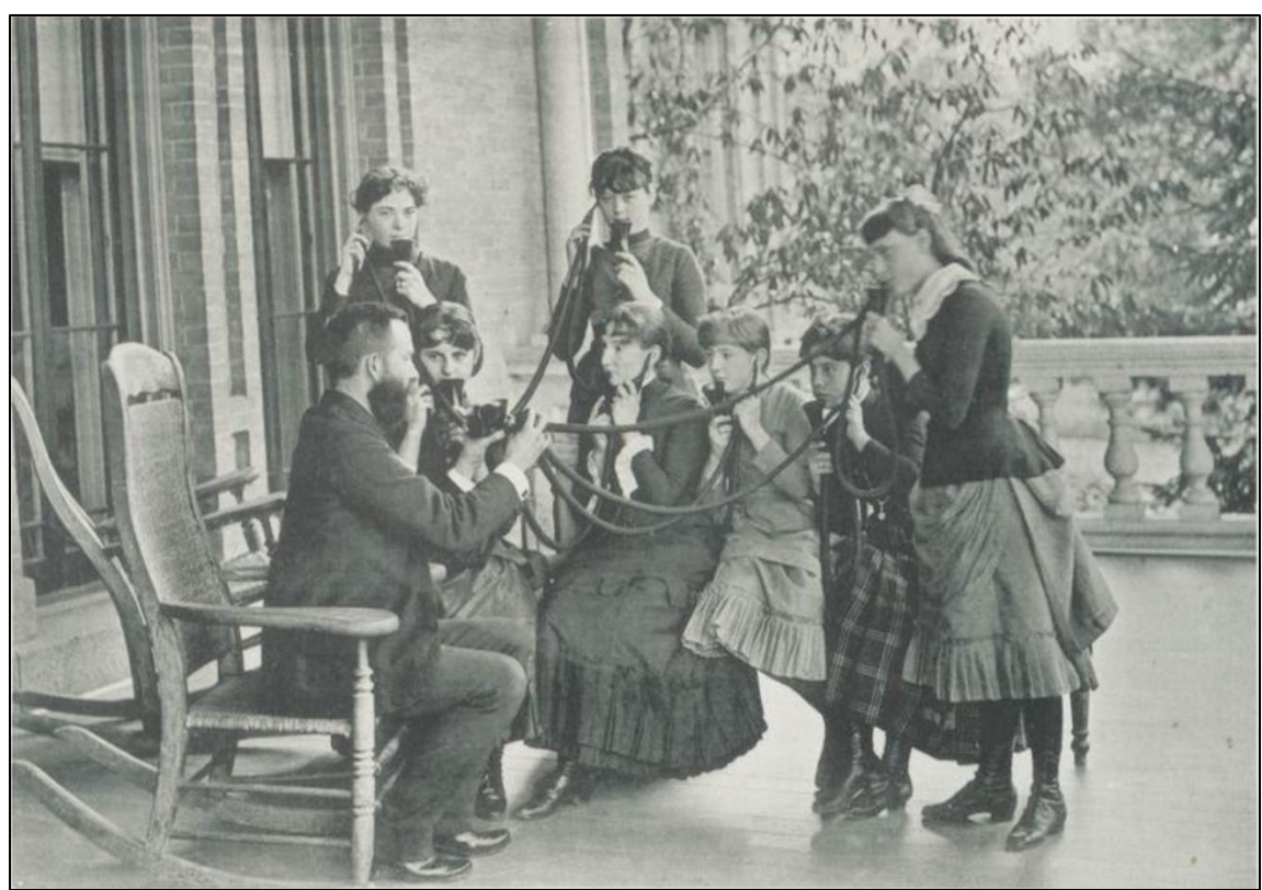
Class using “Currier Conico-cylindrical Conversation Tubes with Duplex Ear-Piece” 1892