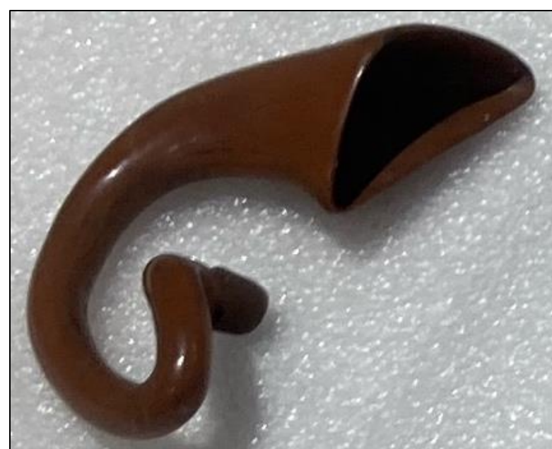
Celluloid Auricle 19 th and early 20 th century