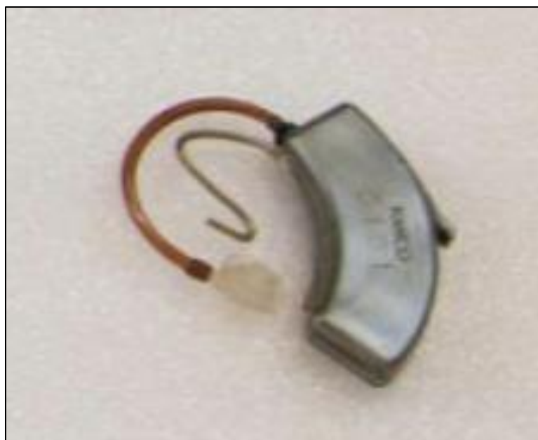
Behind the Ear Hear Aid Late 20 th century