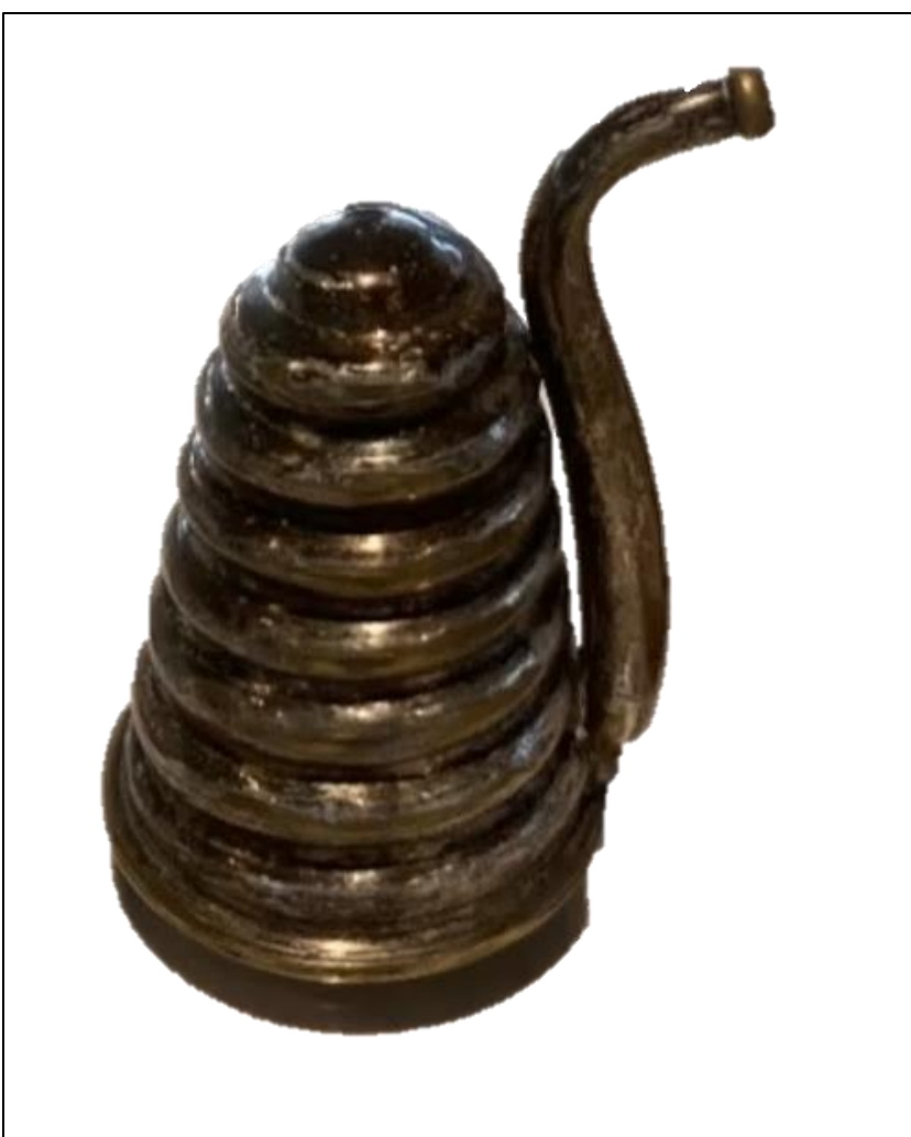
Beehive Ear Trumpet c. 1900