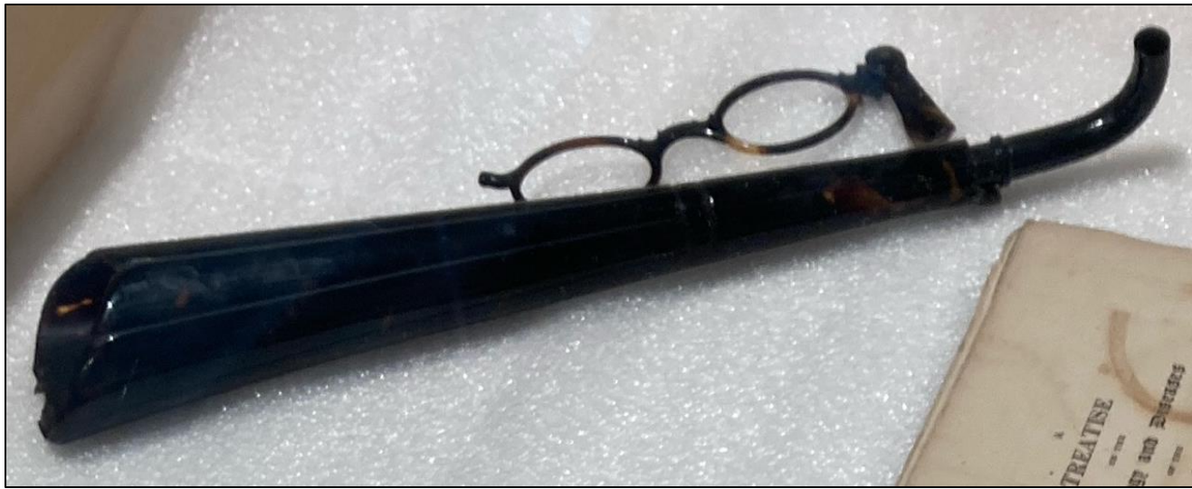
Combination Lorgnette: glasses and ear trumpet c. 1881