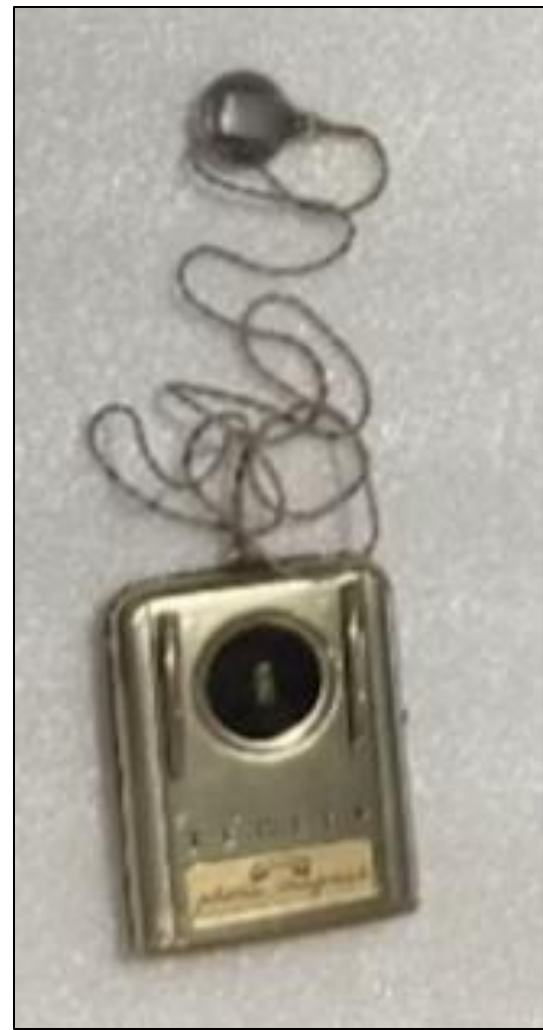
Zenith Royal-T Hearing Aid c. 1953